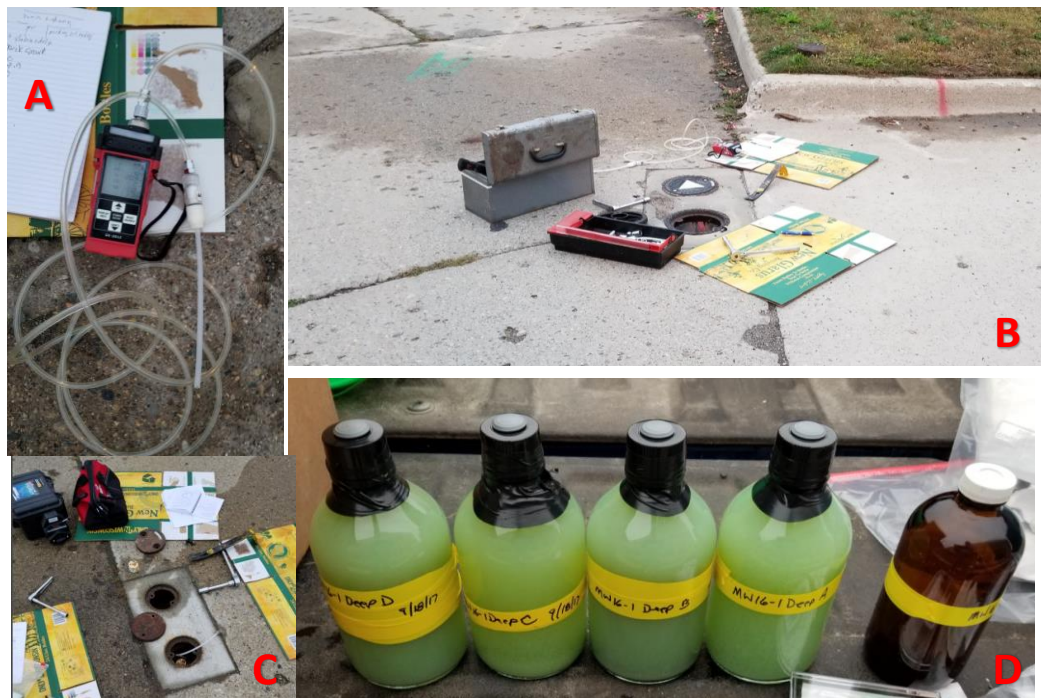
Figure 2: Overview of field sampling; A) handheld GX 1212 applied to down well air gas analysis, B) well 16-1 presented as an example of the wells sampled, C) open shallow and deep well, well pump used is included, D) well water samples.